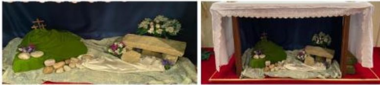
a couple of photos celebrating Easter at St John's Church

St John's Church holds a service every Sunday at 11am. The First and Third Sundays are Holy Communion. The Second, Fourth and Fifth Sundays are Morning Prayer led by a lay member.